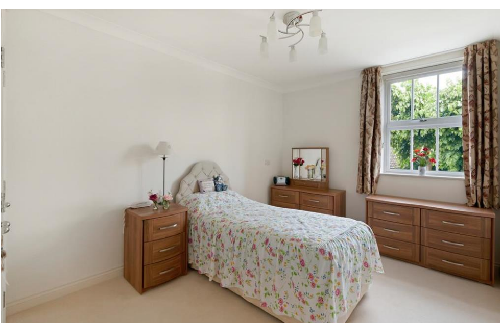
A beautifully presented first floor apartment situated at the heart of the Village. Victoria Place is an exclusive development of nine apartments for the over 55's and is situated in a landscaped courtyard with private terraces, lawned areas and allocated parking.

The accommodation consists of entrance hall, leading to stairs to the first floor. Once Inside the apartment there is a spacious hallway leading to a great size lounge with Juliette balcony. The main living area then opens into a modern fitted kitchen with integrated appliances. From the inner hallway, there is access to two double bedrooms, study/dressing room area, plus a fitted bathroom suite with separate shower cubicle.