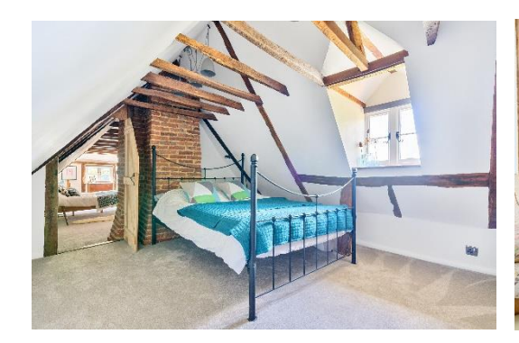
Freehold: Council Tax Band: G, Broadband: Standard, Superfast & Ultrafast

Outside, there is gated access to the large gravel drive, with mature lawned gardens to the side and hedge screen to the front with a detached, recently constructed oak framed double garage with traditional Kent peg tiled roof, mezzanine and two sets of timber doors. The mature rear gardens offer extensive lawns, with mature flower and shrub beds, a variety of trees, sculpted hedge, raised vegetable beds, greenhouses and the feature covered outdoor kitchen/dining area, with butler sink, gas hob and wood fired pizza oven.