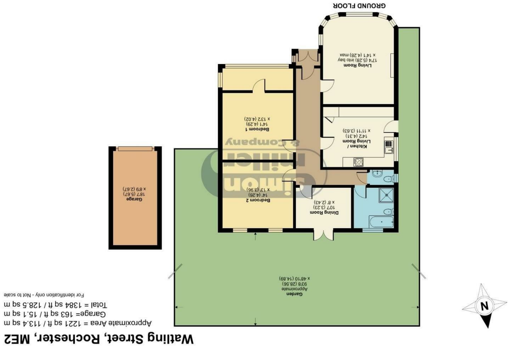
Watling Street, Rochester, ME2

Floor plan produced in accordance with RICS Property Measurement 2nd Edition, incorporating International Property Measurement Standards (IPMS2 Residential). © nchecom 2024. Produced for Simon Miller & Company. REF: 1207874