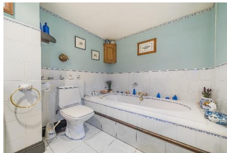
VIEWING ARRANGEMENTS BY PRIOR TELEPHONE APPOINTMENT WITH THE OWNER'S AGENTS