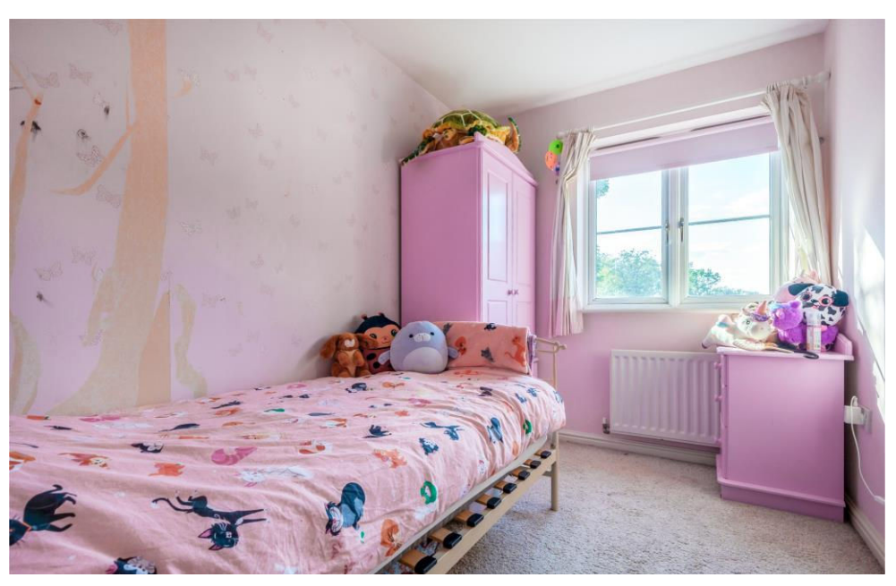
We are delighted to be offering this modern town house situated close to the town centre of Maidstone on Kerry Hill Way. The accommodation includes an entrance hall with downstairs WC, a well fitted kitchen dining room with French doors overlooking the garden and an office which has been created from the converted garage. On the first floor is bedroom two, family bathroom and sizeable living room with 2 Juliette balcony's. On the second floor is the main bedroom boasting an en suite and two further bedrooms. The rear garden is low maintenance with a patio area and the remainder laid to easy grass with flower beds around.

All of the towns amenities are just minutes from your front door and range from some of the best shopping in the county to popular restaurants and bars. There are several train stations with services to London including the new fast link to St. Pancras and the M20 motorway is just minutes away. Close to the house is the River Medway, Whatman park and lovely riverside walks.