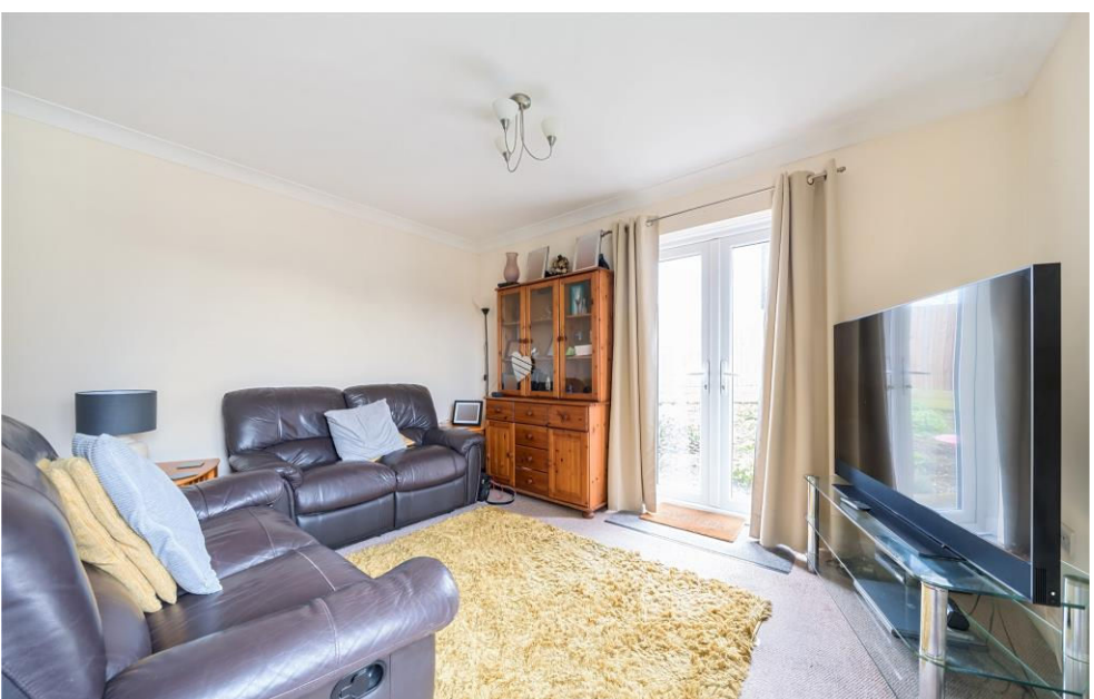
Call now to view this two bedroom ground floor apartment. The property is well presented and located with a short walk to Maidstone town centre and train stations. Both Maidstone east and west train stations provide a fast link to London. The apartment benefits from one allocated parking space and a communal garden.

MATERIAL INFORMATION Leasehold 167 Year Lease Service Charge: £2,112.00 p/a Council Tax Band (C) EPC Report (D)