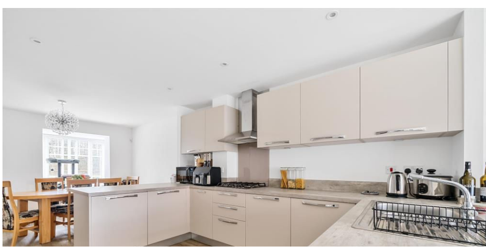
On the ground floor, soft-close units in the kitchen are complemented by a selection of integrated appliances, comprising a gas hob, electric fan oven, chimney hood, dishwasher, and fridge freezer. A utility room, which is situated off the kitchen, contains space for a washing machine and provided direct access to the rear garden.

The dual-aspect Kitchen/living/dining room provides great entertaining space for the family with French doors leading out to the garden. There is a separate living room with French doors to the rear garden. A study and downstairs WC complete the ground floor accommodation.