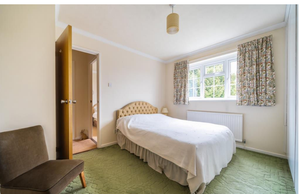
Situated in a popular residential no through road in the Penenden Heath area of Maidstone which offers local shops, access to schooling and excellent transport links either into Maidstone town centre or via road to the M20 and beyond. The Heath itself has plenty of history but is today used for recreation and has a popular Public House on the edge.

This property has been in the hands of the same family for over 40 years, testament to the area and the property itself. The property is well presented throughout and has to be viewed to be appreciated. With 2 reception areas and 4 bedrooms there is plenty of room for the growing family. Externally there is a well tended rear garden and to the front there is a drive leading to the attached garage. The biggest selling point is the homes location on Chattenden Court. It is towards the end of the cul de sac which makes it more peaceful and as you own the land across the road it provides further privacy and no over looking issues.