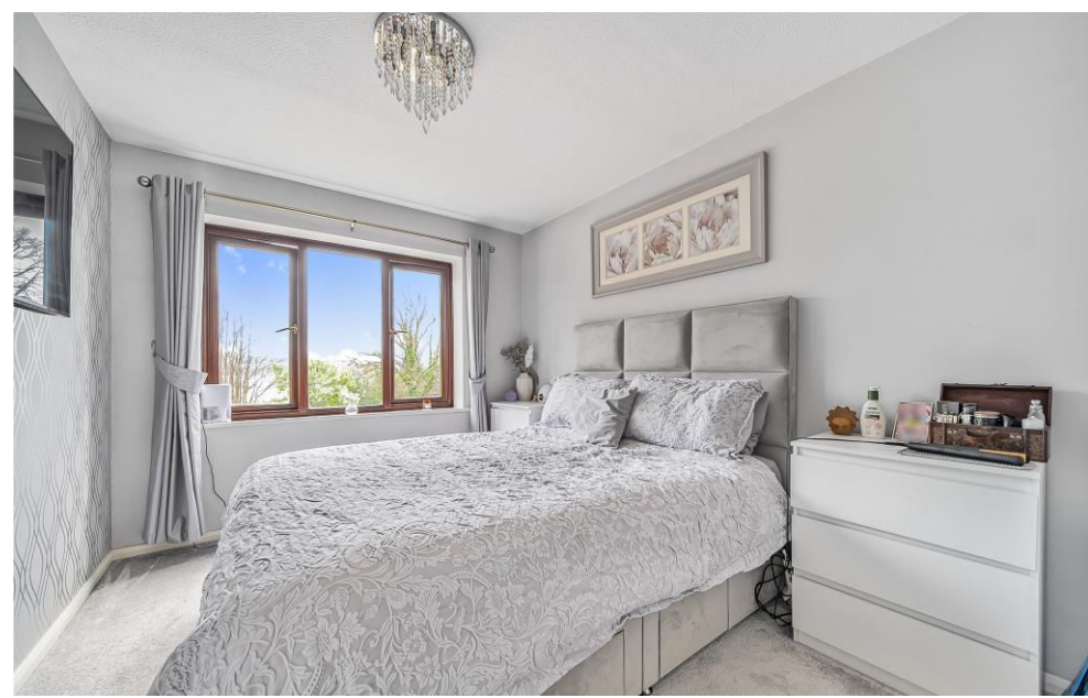
Simon Miller & Company are delighted to bring to the market this spacious two bedroom ground floor apartment. The property offers extremely generous accommodation and comprises entrance hall with storage, a 19' 5" x 10' 8" lounge with access to a separate fitted kitchen. There are two bedrooms overlooking communal gardens. There is a family bathroom.

Maidstone offers a welcoming environment for young and old with the River Medway running through its centre. The town is not only a cultural delight but it offers some of the county's best shopping and eating experiences. Maidstone also has three mainline stations into London. Being such a central location the property is ideally located for the Barracks, East and West train stations making this a great spot for commuters and also within easy walking distance from the town centre.